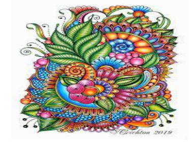
Roll no 31 onwards